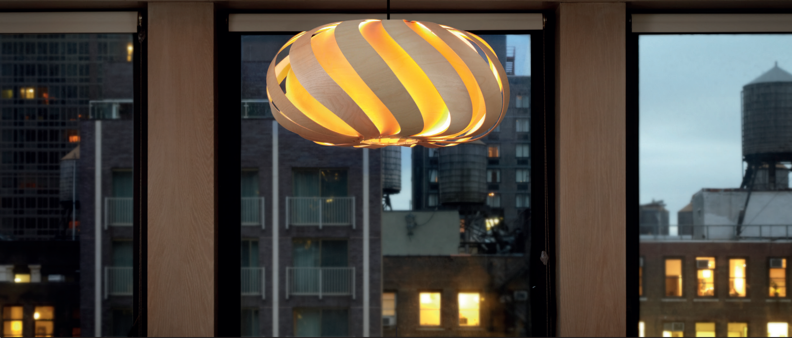
Large Eclipse Pendant