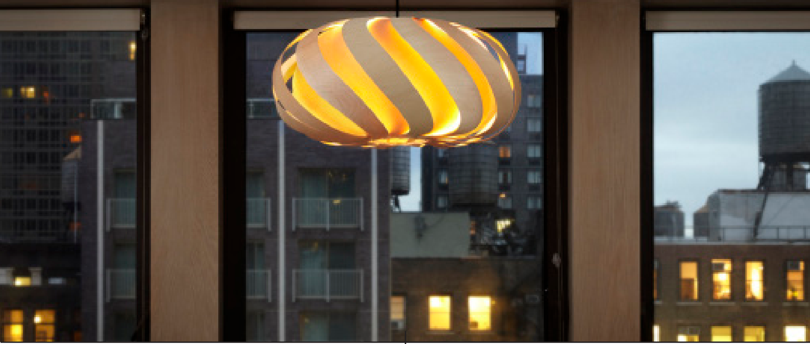
Large Eclipse Pendant